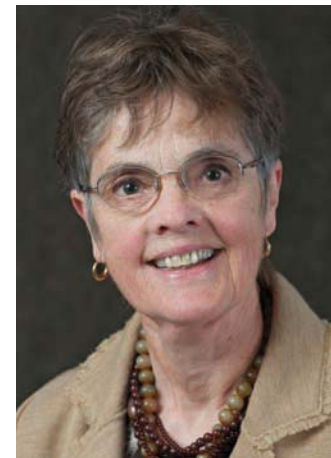
Mary Rhodes Chair